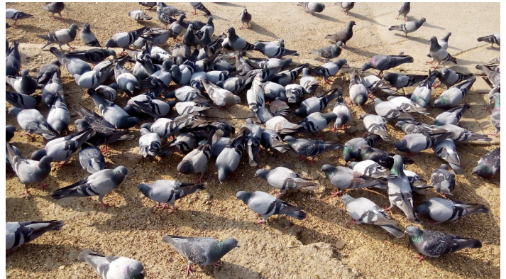
Figure 2. A flock of pigeons feeding.

Pigeons are omnivores and will scavenge in large numbers on living vegetation, fruit, and insects. They also feed on seeds, human garbage, human and animal feed, and fecal matter. They are attracted to open areas where they find food on the ground (Figure 2) and quickly learn where resources are predictably available (Figure 3).