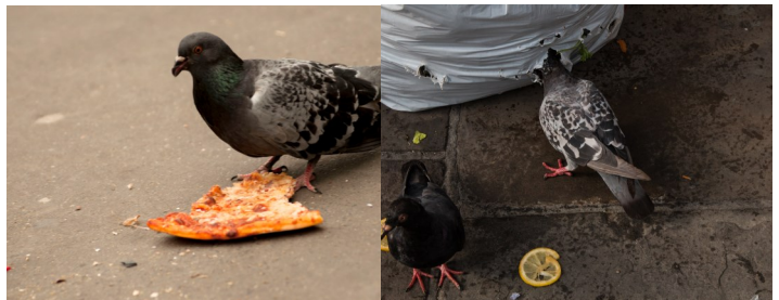
Figure 17. Reduce access to food resources by improving waste management.

Exclusion from food resources (Figures 17) often includes modifying waste management practices.