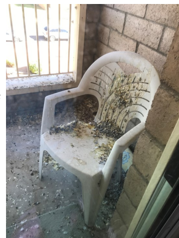
Figure 7. Pigeon droppings cover a balcony chair.

There are health risks associated with pigeon droppings which are of greatest concern to people who have a weakened immune system. This includes those with HIV/AIDS, cancer and transplant patients who are taking immunosuppressive drugs, and those with inherited diseases that affect the immune system. The risk of developing severe disease depends on each person's degree of immune suppression.