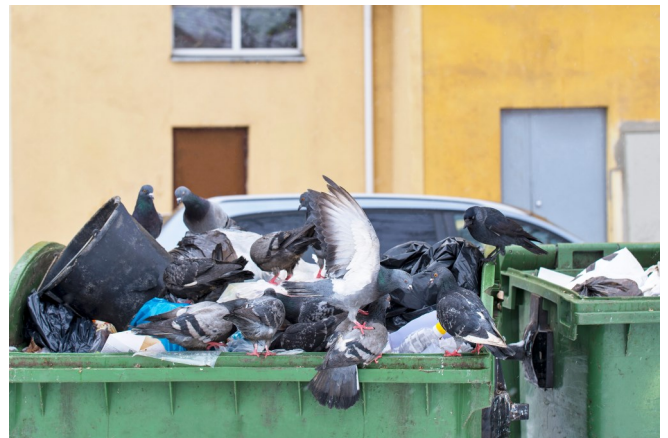
Figure 3. Pigeons feeding on food scraps in a dumpster.