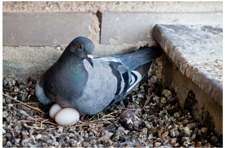
Figure 5. Pigeons with eggs rarely leave them unattended.

After mating, females lay one to three white eggs in under two weeks (Figure 5). Both adults take turns sitting on the eggs which hatch in about 18 days. Babies are called squabs and fledge in 25-45 days depending on weather conditions. Pigeons will create one or two nests and reuse them throughout their lifetime. The birds breed year-round, rearing multiple broods each year for several years.