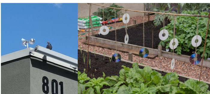
Figure 19. A pigeon used to a light reflector (left) and hanging CD light reflectors (right) do deter pigeons for a while.

Light reflectors and lasers are similarly effective for varying amounts of time depending upon positioning and the pigeons ability to habituate to spinning light reflectors (Figure 19).