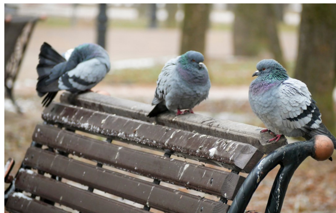
Figure 8. Pigeons and droppings on a park bench.