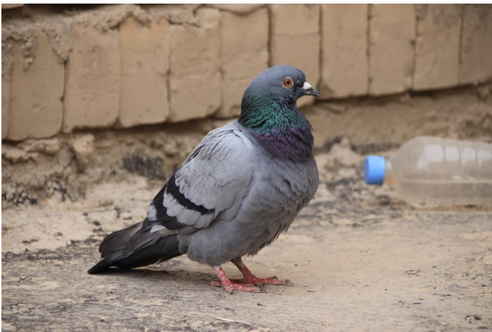
Figure 1. An adult pigeon.

Pigeons, more accurately named rock doves ( Columba livia ), are common in cities and towns around the world. The birds thrive alongside humans as we provide them with a plentiful supply of food and nesting locations. Humans have domesticated the birds for thousands of years using them to carry messages between communities. Pigeons have been used by military forces as messenger and surveillance birds. Humans have, and still do, utilize the birds as a human food source, as racing birds, fancy birds selected for size, shape, color, and behavior, and as cherished pets.