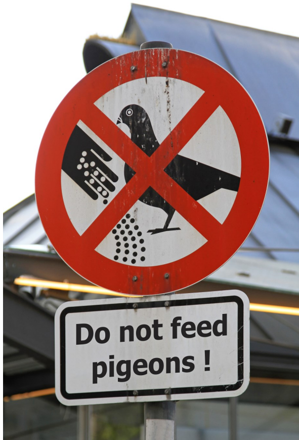
Figure 4. Signage discouraging bird feeding.

In locations where pigeon populations are overwhelming notices discouraging bird feeding are common (Figure 4). Some city governments have established ordinances that prohibit feeding pigeons.