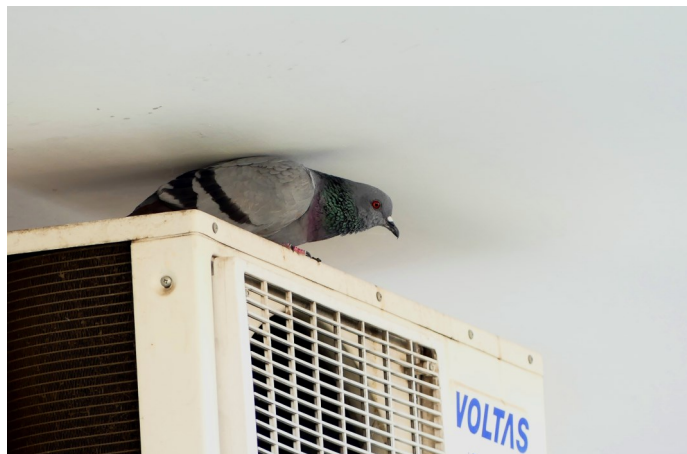
Figure 12. Pigeon perching on a window air conditioner.

From a practical standpoint pigeon management actions center on: exclusion, repellency from areas and resources, and population reduction. While minimizing food, water, perching (Figure 12) and nesting opportunities renders a location less attractive to pigeons, those tactics are often overlooked in favor of immediately reducing populations. However, trapping and releasing, or using lethal population reduction often results in a rapid rebounding of the populations.