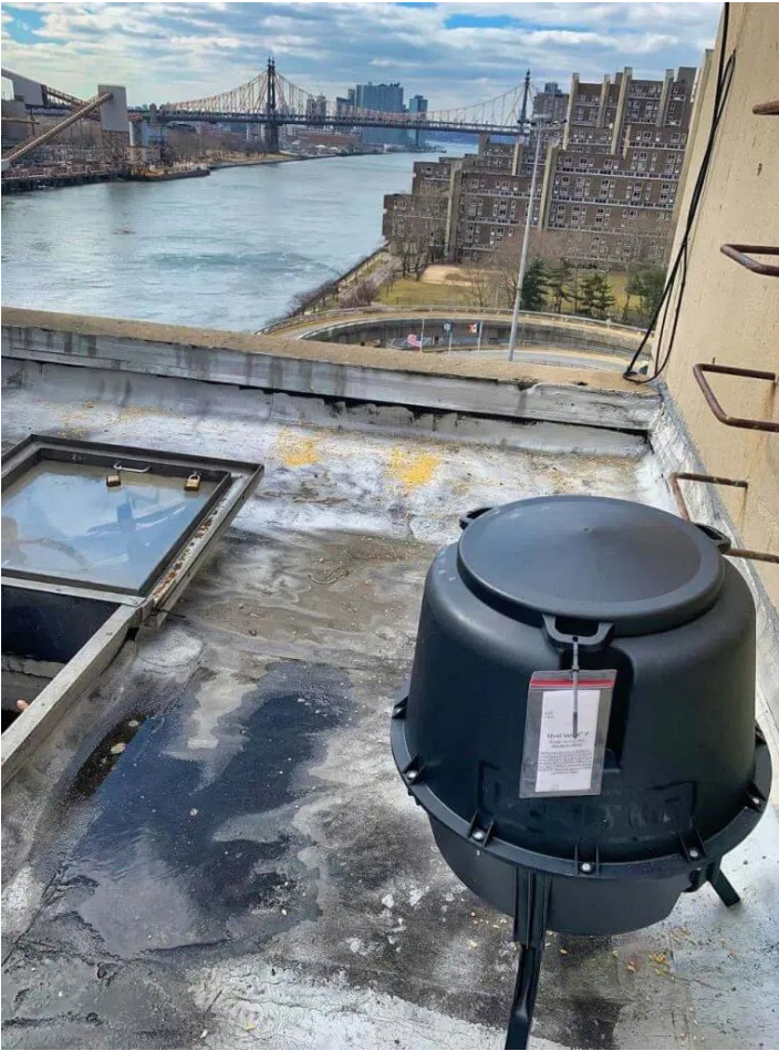
Figure 24. OvoControl® P ncarbazine bait dispenser.

Nicarbazin interferes with the formation of the vitelline membrane which separates the egg yolk and egg white. The effect on development and hatchability is a function of time and dose, and the effect is reversible if the bait is no longer accessed by the bird. Eggs from birds feeding on ncarbazine bait daily generally do not hatch and label instructions minimize nontarget species.