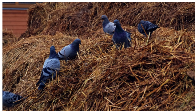
Figure 10. Pigeons feeding on manure and straw bedding removed from horse stables.

Serious health impacts can result from the consumption of water and food contaminated with pigeon droppings. Pigeons will forage on animal feces and are attracted to concentrated animal farming operations and farm facilities in general because of easy access to food and water resources (Figure 10). Pigeons are considered to be important reservoirs of the Shiga toxin-producing bacterium Escherichia coli 0157:H7 strains which can cause serious human illness and cause severe damage to the lining of intestines and kidneys.