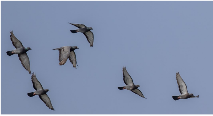
Figure 27. Pigeons flying.