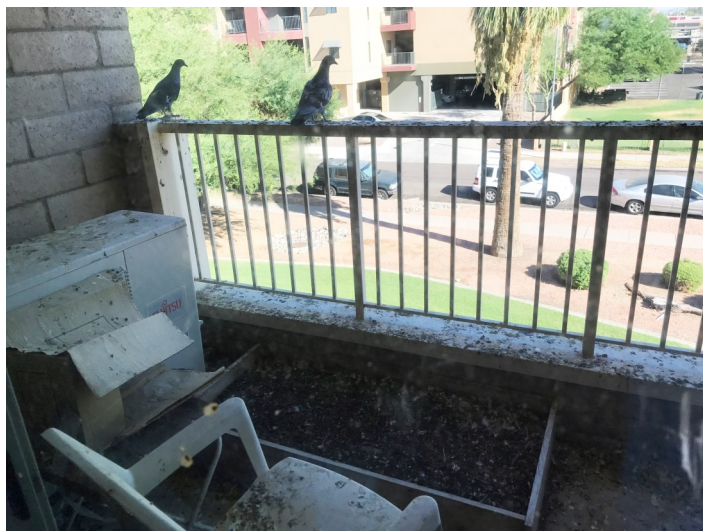
Figure 6. Pigeons nesting on an apartment balcony.

Pigeons are commonly considered to be pests in urban areas, even when populations are low. When nesting on or in buildings droppings build up quickly generating considerable concern for residents, property managers and owners (Figure 6).