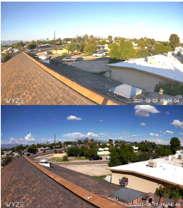
Figure 23. Electromagnetic pulse device turned off (top) and on (bottom).

Holland (2010) tested the effects of a strong magnetic pulse, designed to alter the magnetic sense of passerine birds. The researcher demonstrated that disruption of the iron-mineral-based magnetic sense affects songbird behavior. Additionally, researchers have documented the negation of repellency effects is a local anesthetic is administered to the beaks of birds, providing circumstantial evidence that the iron-mineral-based deposits in the beak play a role in magnetic field sense (Wiltshcko et al. 2009).