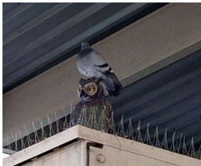
Figure 18. Models of predators are not usually effective for very long.

Models of owls, hawks, snakes, and cats vary in effectiveness depending how realistic they are and how often they are relocated to new locations.