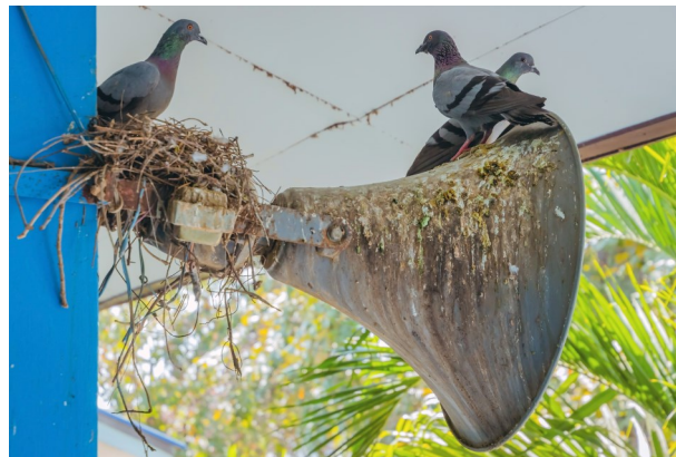
Figure 11. Pigeons nesting on school bell.

All bird waste, used cleaning materials and contaminated PPE should be double-bagged and disposed of in an external dumpster.