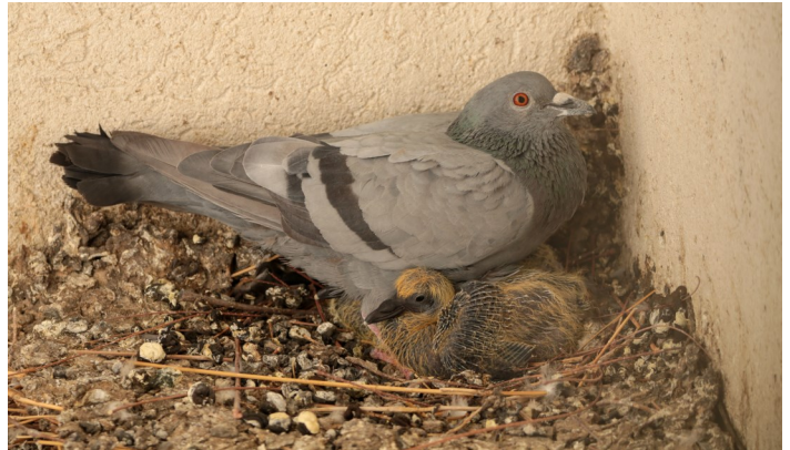
Figure 25. Pigeon parent and Squab.

A single flock of pigeons can range from tens to hundreds of birds. A flock may nest and roost (Figure 25) in one location, feed at another (Figure 26), fly (Figure 27), and/or loaf (hangout) (Figure 28) at yet another location.