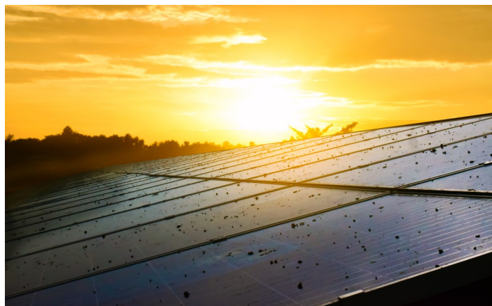
Figure 9. Pigeon droppings on solar panels, which reduces efficiency.