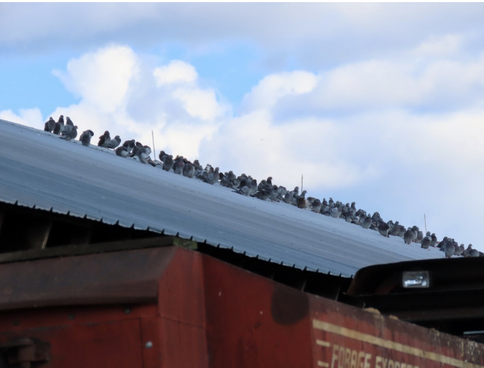
Figure 28. Loafing pigeons.

Since pigeons use multiple locations for different purposes, roosting and nesting locations may be several miles from their regular feeding and loafing areas. Pigeon flocks will often share food resources with unrelated flocks but tend to be more defensive over nesting and roosting (sleeping) areas.