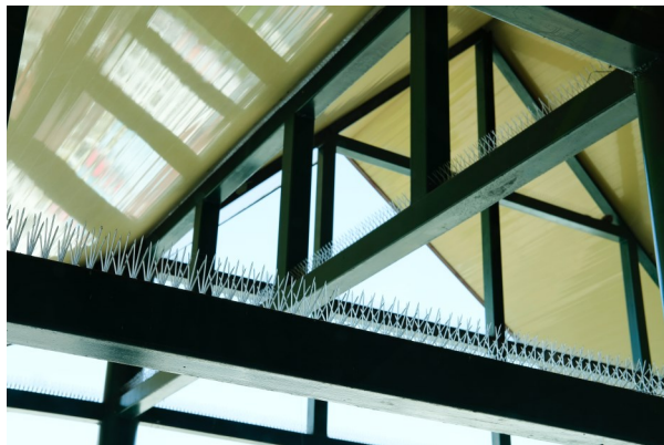
Figure 14. Well-placed bird spikes prevent pigeons from landing.

Pigeons can also be deterred from perching and loafing on some structures by installing bird spikes (Figure 14), wires (Figure 15), or other deterrents.