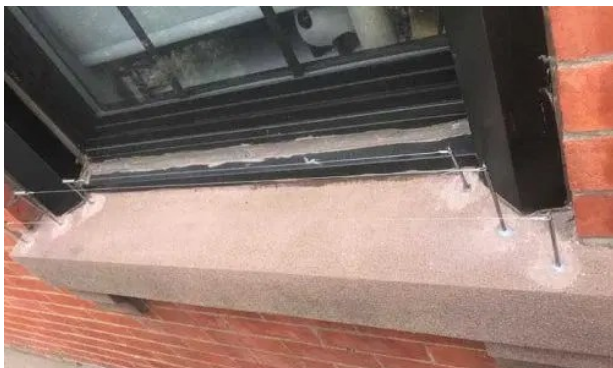
Figure 15. Well-placed bird wire is almost invisible and prevents pigeons from landing.

However, installing bird wires and spikes is a job for professionals as deterrent selections and correct installation will impact success. If bird spikes are installed inappropriately or incorrectly they can actually generate nesting opportunities for native bird species or pigeons themselves (Figure 16).