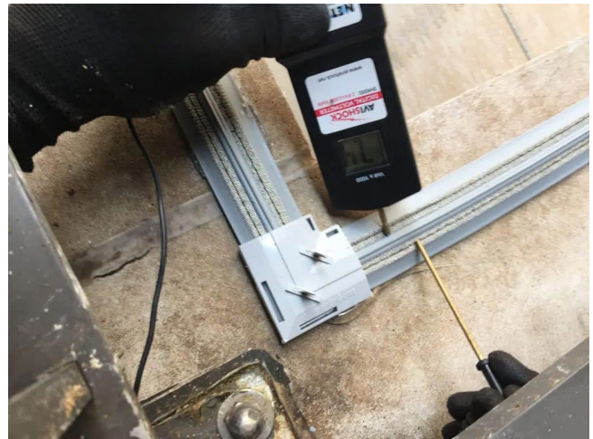
Figure 21. Electric shock track placed along ledges of buildings will prevent birds from landing.

Electric shock bird deterrent systems are also available for repelling pigeons from perching areas (Figure 21).