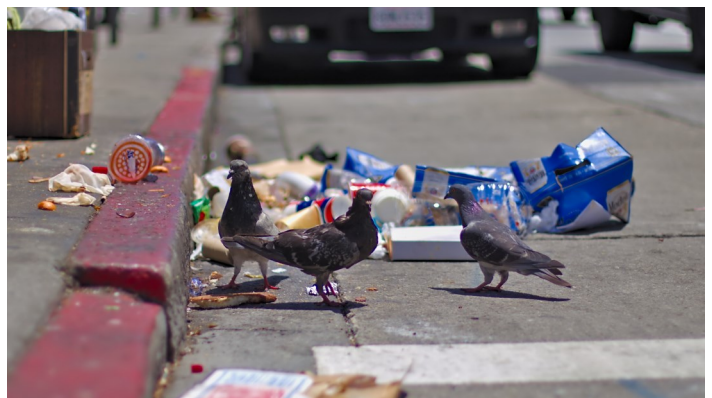
Figure 26. Pigeons feeding.