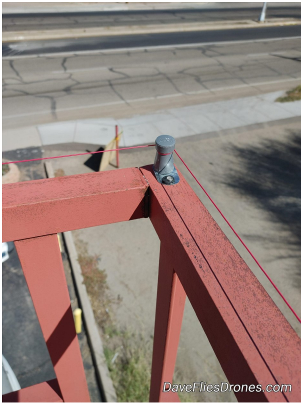
Figure 22. Electromagnetic pulse wire around a building perimeter.