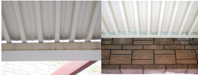
Figure 13. Roosting opportunity (left) and after pest-proofing measures are taken (right).

Exclusion involves blocking access to roosting and nesting areas. Birds can be excluded from lofts, steeples, vents, and eaves using exclusion mesh. Bird netting necessitates expert installation and maintenance to avoid the capture and killing of native birds. Roosting on ledges can be discouraged by changing the angle of a ledge to 45° or blocking access (Figure 13).